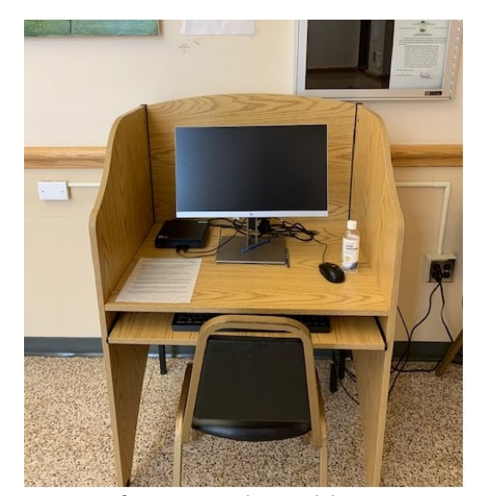
One of two PATs in the Brattleboro Court

When our courthouses reopen to the general public after the conclusion of the judicial emergency, visitors will notice new public access computer terminal(s) in the lobbies. It is anticipated that every courthouse will have at least one public access terminal (PAT) and that many courts will have two or more.